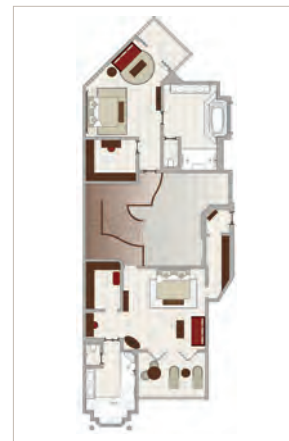
Royal Suite - First Floor