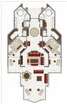
Crystal Rock Suite, Coin de Mire Suite, Gabriel Island Suite